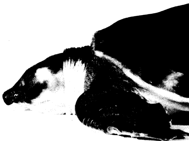
Figure 3. Carettochelys insculpta from Australia.

each with two claws. The dorsal surface of the tail is covered with a single line of crescent-shaped scales that decrease in size from the base to the tip. Prominent folds of skin extend laterally on each side from the undersurface of the tail across the thigh region and down the hind limbs. The nostrils are at the end of a prominent fleshy proboscis. Mature males can be distinguished from females of the same size by the tail, which is larger in males to enable successful copulation.