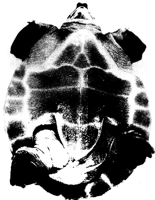
Figure 2. Carettochelys insculpta from Australia.