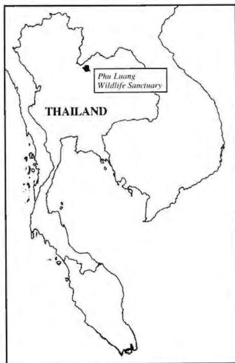
Figure 1. Location of Phu Luang Wildlife Sanctuary in Thailand.

One of the few populations of Manouria impressa with a good outlook for survival occurs at Phu Luang Wildlife Sanctuary, covering about 800 sq. km in Loei Province, northeastern Thailand (17°20'N, 101°30'E) (Figs. 1-2). For the past three years, one of us (TC) has been working as director of Phu Luang Wildlife Research Center, located in a clearing in the hill forest inhabited by M. impressa ; the others (KT and PPvD) visited at various times. A large enclosure (about 100 sq. m) was constructed at the forest edge and decorated with vegetation and pools to provide the major habitat features. A total of nine M. impressa , up to six at a time, have been kept here, permitting behavioral observations on the assumption that their behavior is not very different from animals living wild on the other side of the fence. In addition, animals were observed in the forest on about 15 occasions, either by us or by forest rangers, but no precise records were kept.