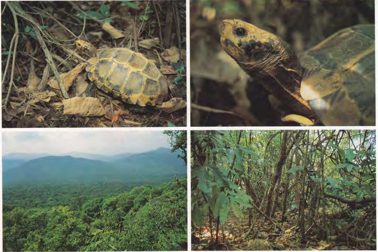
Figure 2. Top left: adult female Manouria impressa (carapace length 283 mm, weight 3.7 kg) in natural evergreen forest habitat, Phu Luang Wildlife Sanctuary, Thailand. Top right: close-up of same female. Bottom left: general topography and hill evergreen forest habitat of M. impressa at Phu Luang. Bottom right: forest floor and understory of hill evergreen forest microhabitat of M. impressa at Phu Luang. All photos by P.P. van Dijk, March 1994.

water turtles Platysternon megacephalum and Cyclemys dentata . A few tortoises also occur on flat mountain top areas, but there is insufficient data to speculate whether this is a seasonal occurrence. Some tortoises have also been reported from bamboo forests on the mountain slopes. The natural lower altitude limit is unknown; deforestation of the lowlands, forest fires, and hunting on the lower slopes have left no tortoises below the sanctuary boundary at about 600 m.