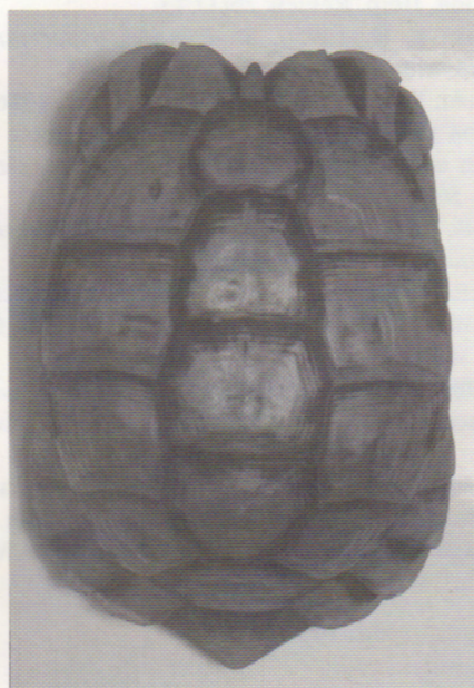
Figure 1. Record-sized female specimen of Testudo kleinmanni .

Despite its recent transfer from Appendix II to Appendix I of CITES (Pritchard, 1995), Testudo kleinmanni continues to be traded illegally. On 7 April 1995 some passengers arriving from Cairo were intercepted at Ferihegy Airport, Budapest, Hungary, with six Egyptian tortoises concealed in their luggage. The animals were confiscated by customs and conservation officials and were transferred to the Zoological and Botanical Garden, Budapest. Three of them died within two months and were subsequently deposited at the Hungarian Natural History Museum (HNHM). One female in this series (shell and skull in dry collection, all other parts preserved in fluid [HNHM s/n; presently labeled BLF 570.1]) surpasses by nearly 12 mm the maximum carapace length of 132.3 mm, the previously reported maximum size for this species (Farkas, 1993). Its dimensions are (all straight-line measurements taken with vernier calipers): maximum carapace length, 144.2 mm; median carapace length, 137.7 mm; maximum carapace width, 97.8 mm; maximum plastron length, 122.3 mm; maximum shell height, 70.8 mm (see Fig. 1).