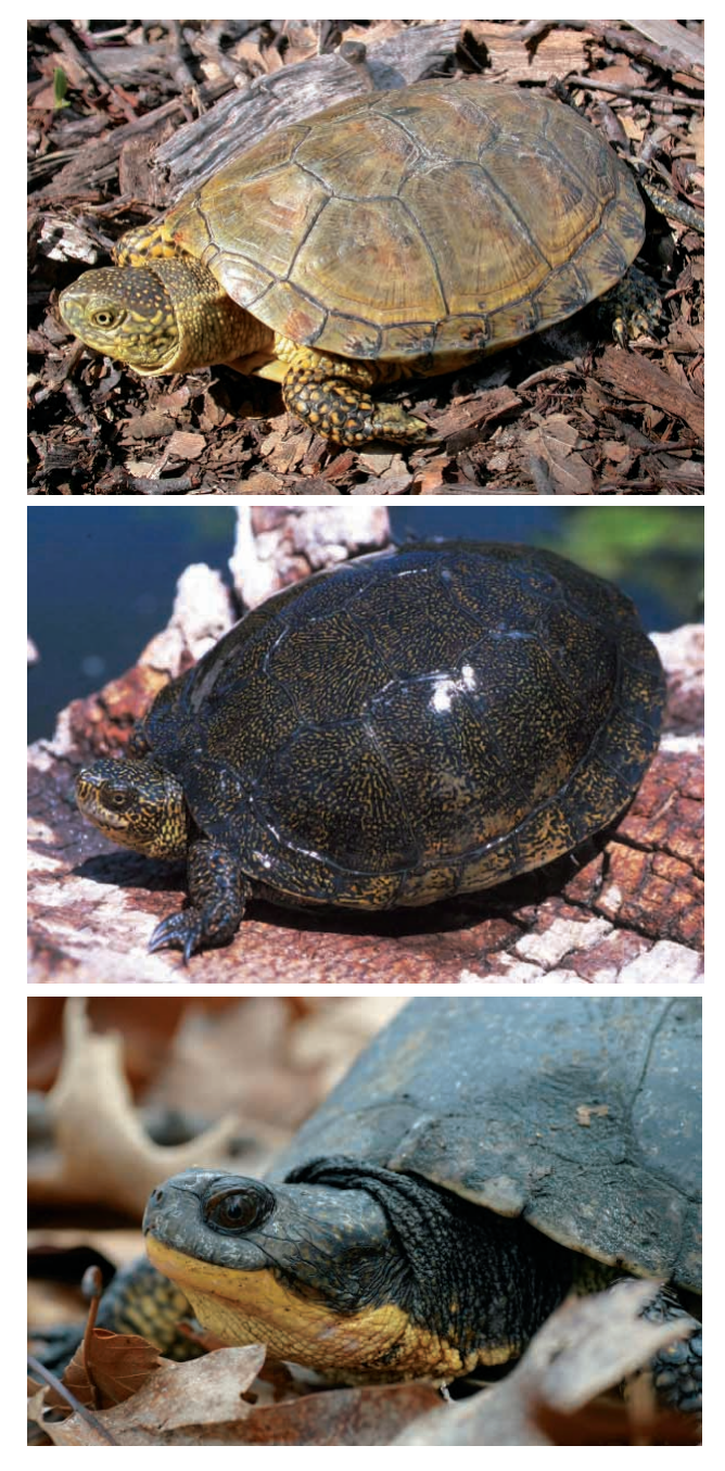
Figure 2. The three species that comprise the " Emys complex". Top: Emys orbicularis from Iran. Middle: Emys or Actinemys marmorata from California. Bottom: Emys or Emydoidea blandingii from Michigan.

relatively inclusive clades (down to the Linnaean rank level of family) of turtles as a test case to explore the challenges of converting well-established rank-based names into a rank-free taxonomic system. As an example from the other end of the phylogenetic spectrum, Engstrom et al. (2004) proposed a rank-free classification for the 26 species of softshell turtles (the traditional family Trionychidae) based on their molecular and morphological phylogenetic analysis. These two examples span a broad range of taxonomic levels, and deal with the challenges inherent in switching to a rank-free classification.